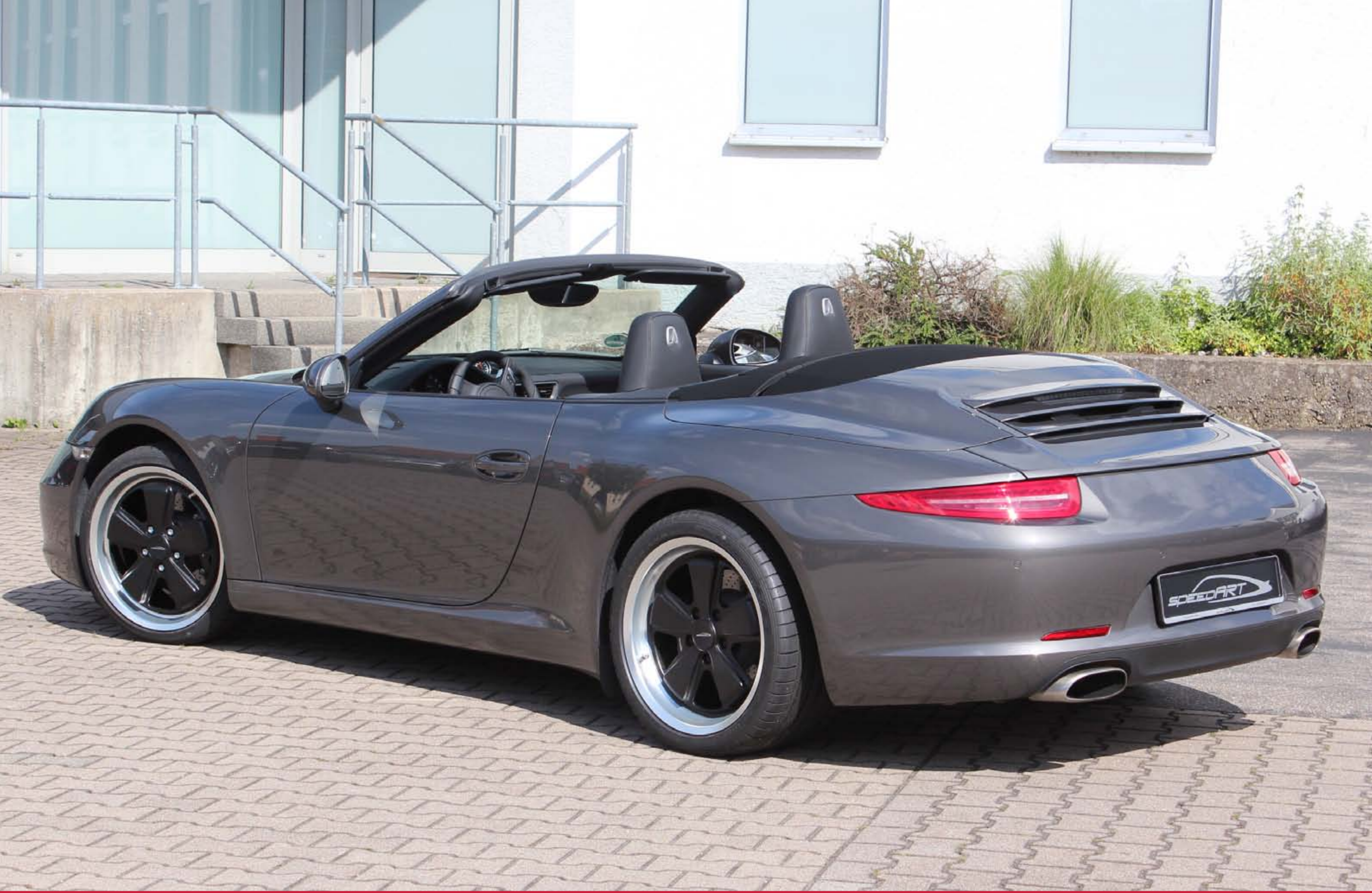
Original Fuchs wheel 19"